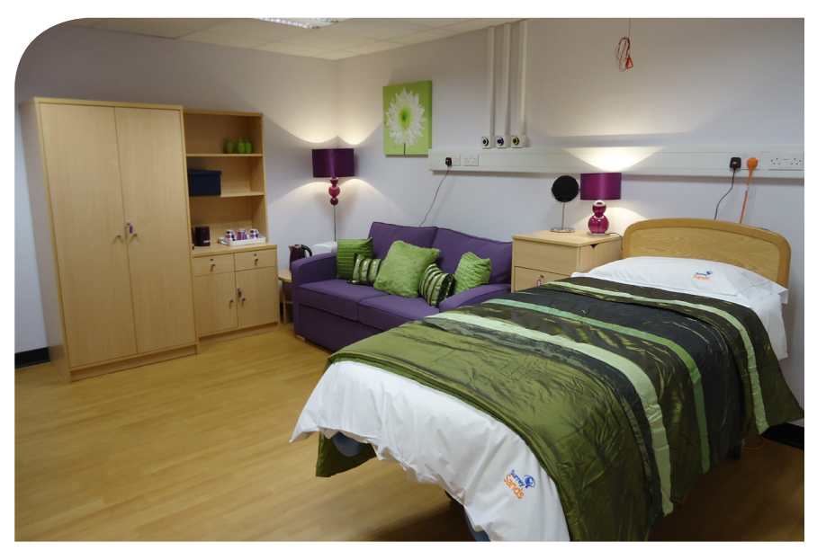
Forget-Me-Not bereavement suite, Royal Surrey County Hospital