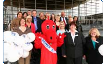
Culmination of the Welsh journey, outside the Senedd

The petition was subsequently considered by the Petitions Committee who wrote to the Minister for Health and Social Services to raise our concerns. Her response guaranteed that she would “be taking forward a number of issues...raised” and instructed officials to “continue to work with Sands to establish what