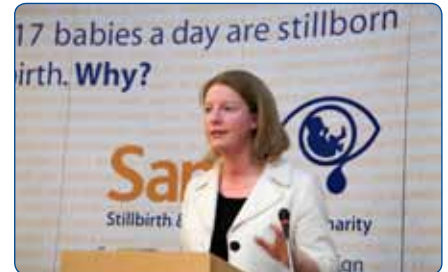
Shona Robison MSP at our launch event

The Scottish Government agreed to funding of £20,000 to ensure maternity staff across Scotland are given specialist education and training so that they will be better equipped to support bereaved parents. Public Health Minister Shona Robison announced the funding at the event, saying: